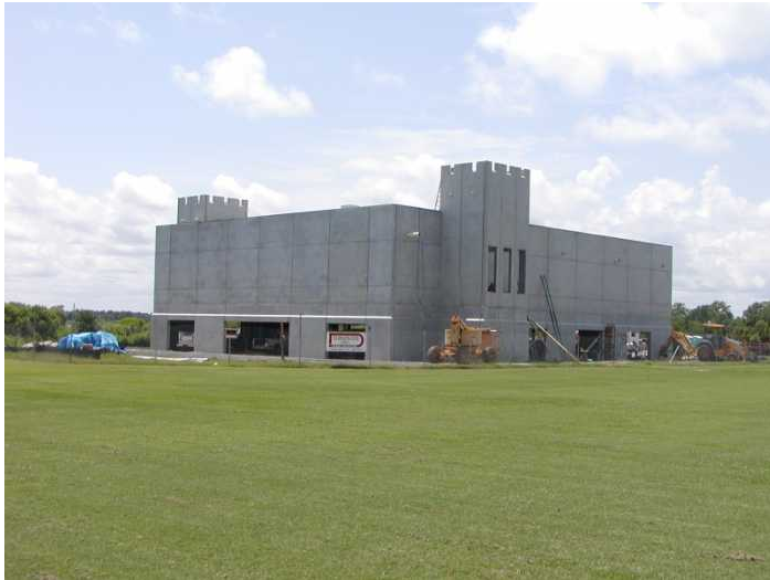
Figure 1 - Marksmanship Center

Construction is complete on the joint use marksmanship center constructed at the Citadel. If you have ever been to the Citadel, the architectural style of the Marksmanship Center will follow that of their existing buildings, as shown in the photo. Company A, 1-118 Infantry Battalion will utilize the facility on the Guard's behalf.